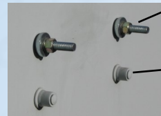
Clamp bar bolts w/ spherical washers