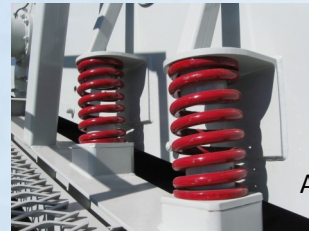
Alco isolation springs