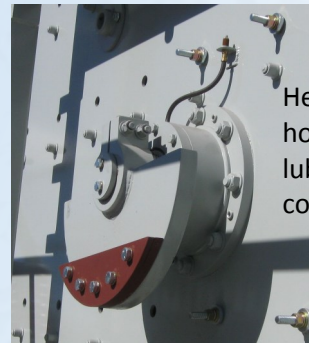
Heavy duty bearing housing with remote lube and adjustable counter-weight.