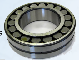
100 mm heavy duty shaker screen bearings