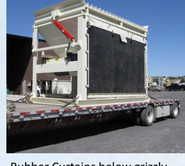
Rubber Curtains below grizzly hopper.