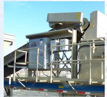
Switchgear mounted on carrier with access platform and safety railing.

Contact us about the Fab Tec Mixing plant and the options that will best suite your needs.